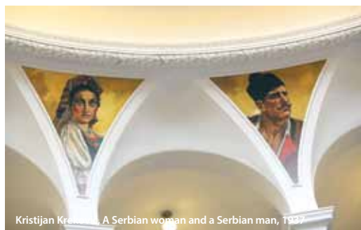
Kristijan Krešimir, A Serbian woman and a Serbian man, 1927

According to the design for the National Assembly building and during the work on its interior decoration, it was decided that sculptures would represent the significant part of the decoration, uniting artistic values with the visual manifestation of the national, spiritual and political identity According