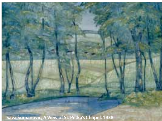
Sava Šumanović, A View of St. Petka's Chapel, 1938