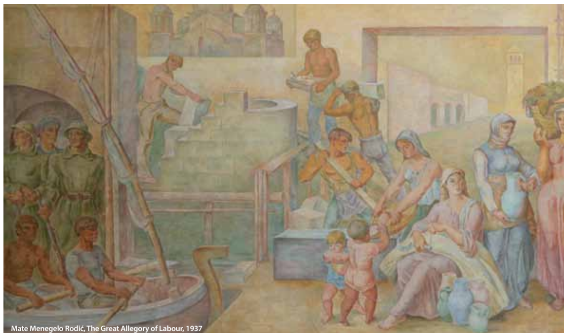
Mate Menegelo Rodić, The Great Allegory of Labour , 1937

naming temples and the interiors of the public buildings. Kristijan Kreković made six female and male portraits respectively, by caricaturing the faces, on twelve pendetives of the same room, dressed in the peasant costumes of the Yugoslav nations of the date.