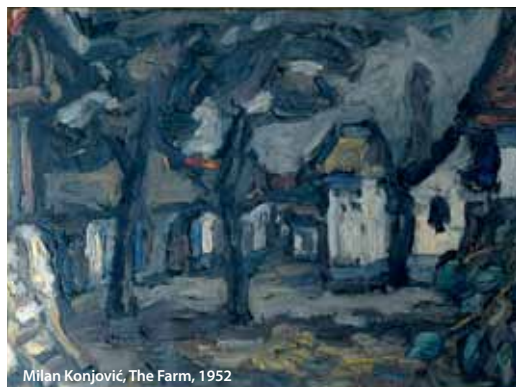
Milan Konjović, The Farm, 1952