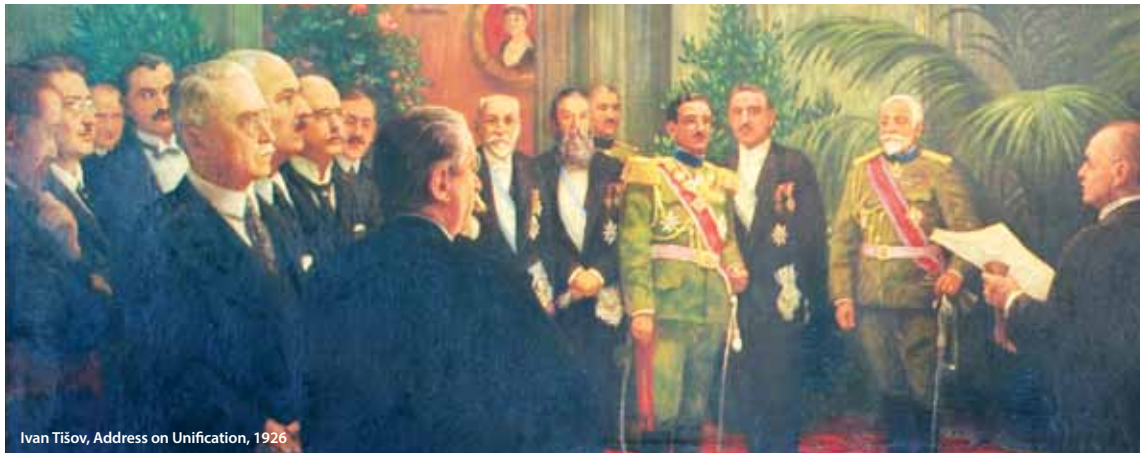
Ivan Tišov, Address on Unification, 1926